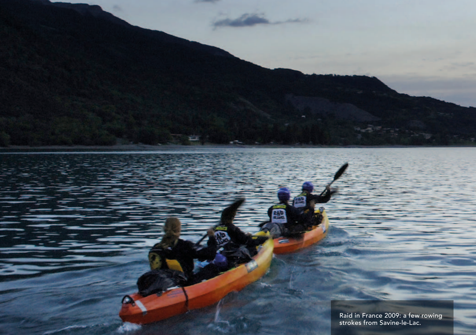
Raid in France 2009: a few rowing strokes from Savine-le-Lac.