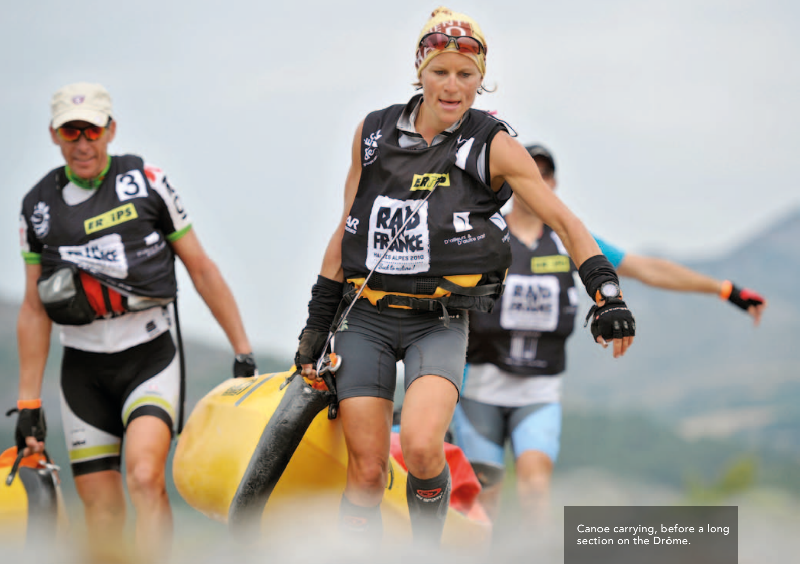
Canoe carrying, before a long section on the Drôme.