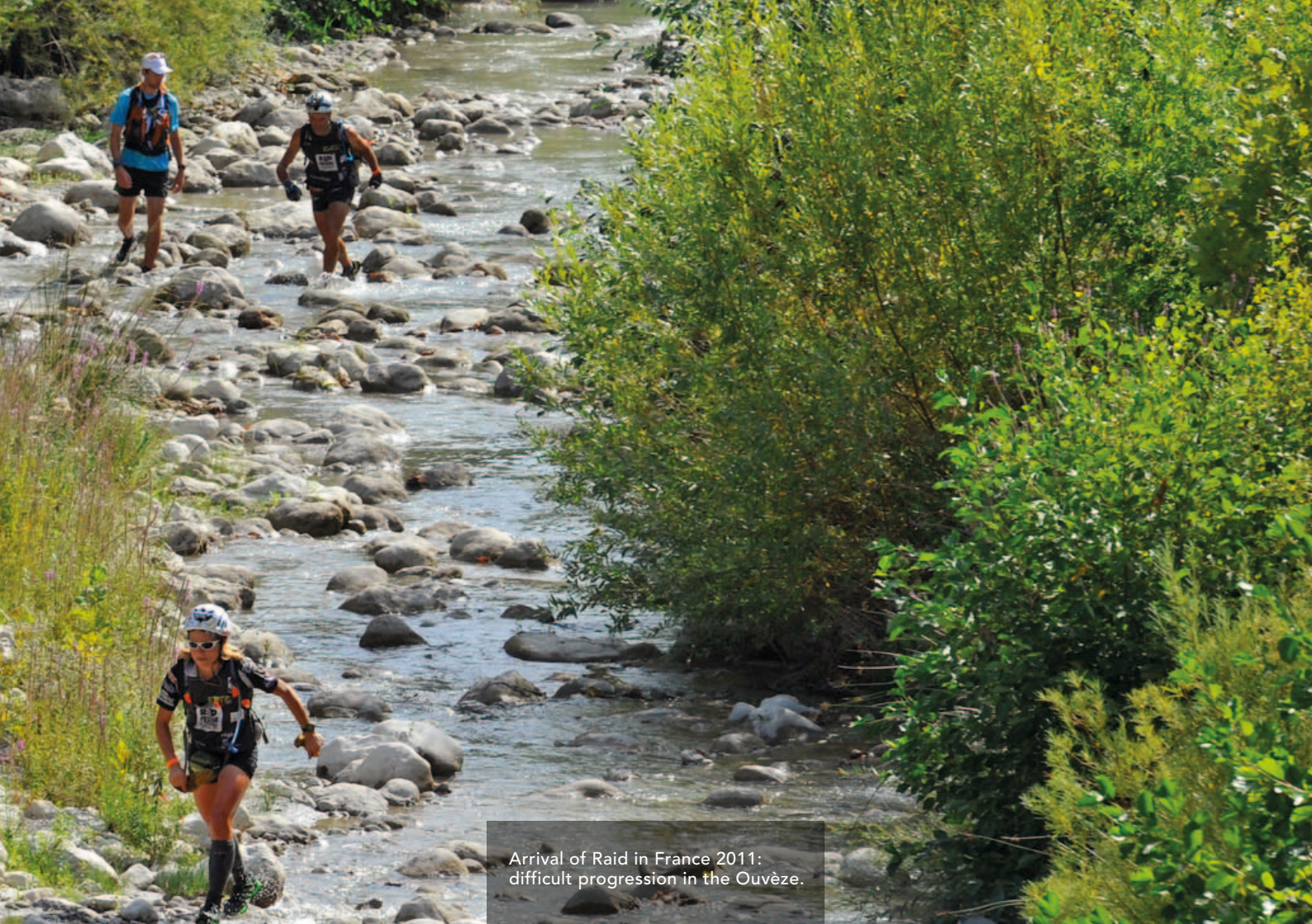
Arrival of Raid in France 2011: difficult progression in the Ouvèze.