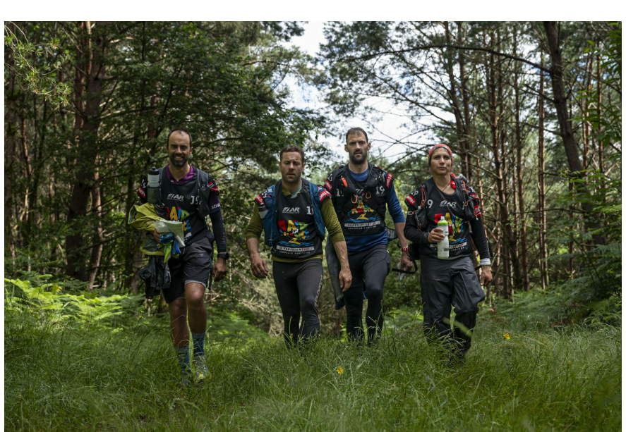
Trek through the plateau de Millevaches

Arrival and finish line day will be tomorrow at the Centre des 1,000 Sources in Bugeat, where teams will be arriving throughout the morning and early afternoon. This sports center, the headquarters of the race, is designated as a preparation center for the Paris Olympic Games. It was created in 1960, inspired by Alain Mimoun, the Olympic marathon champion at the 1956 Games. Come and cheer on the teams!